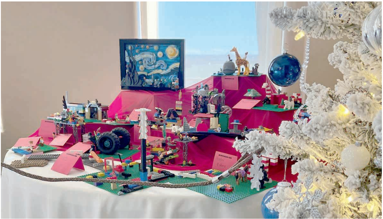
This display was created by the local Lego club and attracted a lot of interest during the Christmas season.