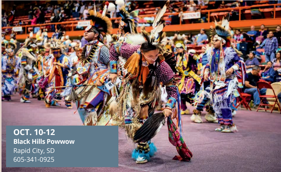
OCT. 10-12 Black Hills Powwow Rapid City, SD 605-341-0925

To have your event listed on this page, send complete information, including date, event, place and contact to your local electric cooperative. Include your name, address and daytime telephone number. Information must be submitted at least eight weeks prior to your event. Please call ahead to confirm date, time and location of event.