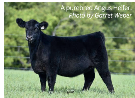
A purebred Angus Heifer.