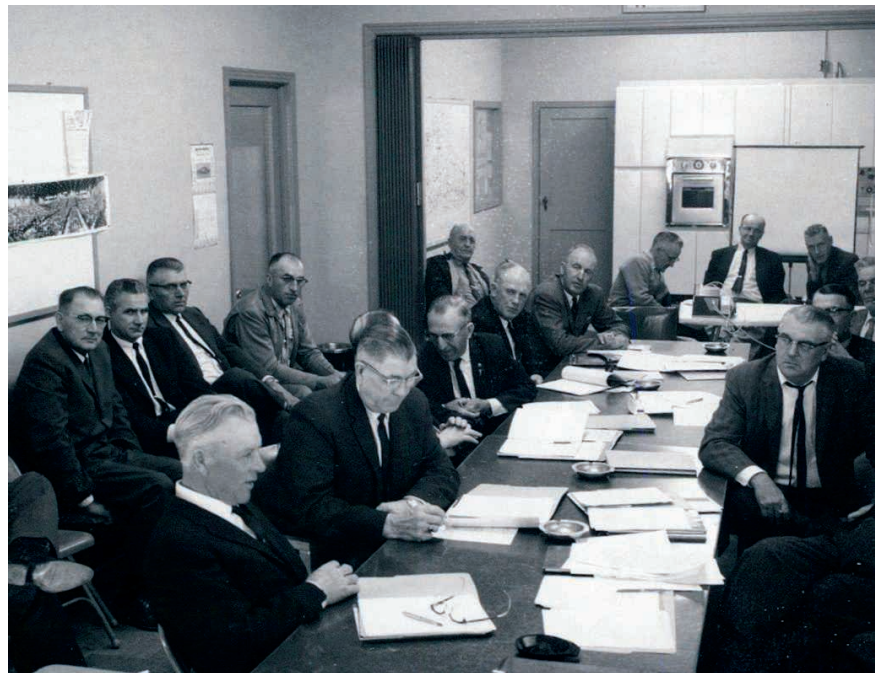
(Top) A West Central Electric Annual Meeting. (Bottom) A West Central Electric Board Meeting with the REA.