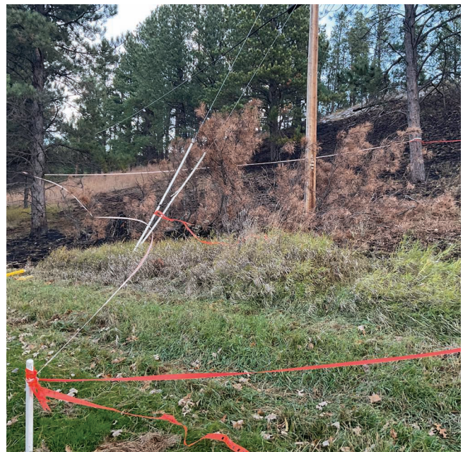
(Left) A fire broke out on Oct. 19 after a tree landed on a power line. By the time fire crews responded, power to the line had been turned off.