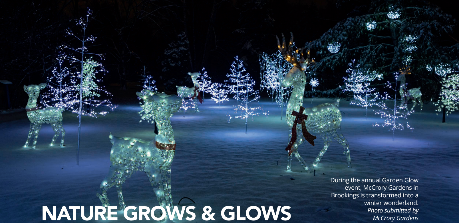
During the annual Garden Glow event, McCrory Gardens in Brookings is transformed into a winter wonderland.