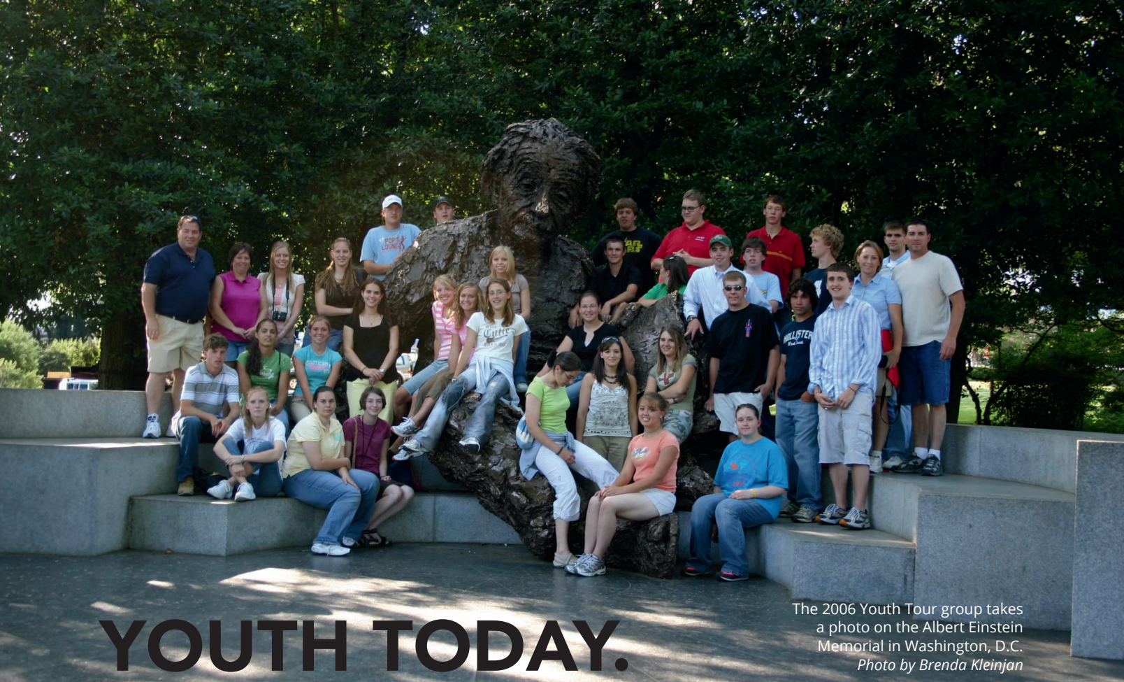
The 2006 Youth Tour group takes a photo on the Albert Einstein Memorial in Washington, D.C.